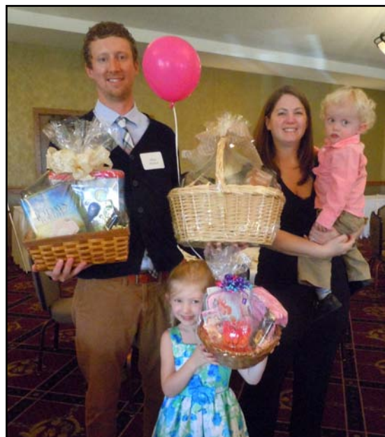
Happy family who had winning bids on several of the Silent Auction items at the 2014 CPO Luncheon & Fundraiser.

May we all see more than others see. May we all embrace a wider reality. We must beg God for the grace to see life with the eyes of the saints and in all humility learn to see Christ in others and be Christ to others. It is only the humility, love, and, yes, courage of faithful disciples of Christ that will bring light and clarity to the darkness and confusion of our times and allow others to discover that "wider reality" Who is God Himself. †